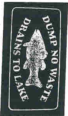
Example of an Inlet Marker

Your neighborhood curbside inlets should be marked with signs to help discourage waste Dumping. Illicit discharges include any material to the storm sewers other than rain water. Accidental or deliberate dumping of pollutants is against the law and should be reported to your local municipality.